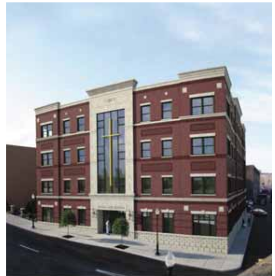
215 East New York Street

Look for an announcement for the ground breaking ceremony in the near future, and continue to pray for this much needed facility.