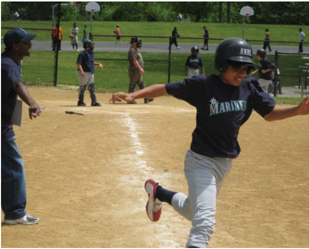
Kids have opportunities to interact with positive adult and youth role models, imparting Christian moral values.