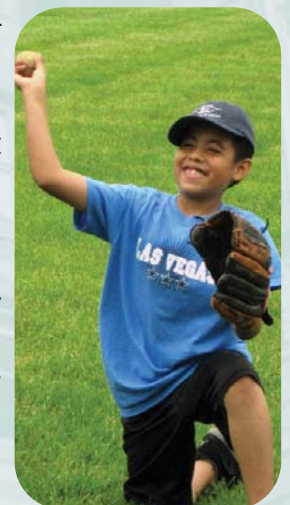
Throwing practice at an ANBL Camp.

An essential component of the ANBL is the opportunity to share Jesus with young people and their families. It has been great to see the creativity of the coaches these past years. Some coaches have had team dinners at their homes; others had Bible studies and verse memorization, and some reached out by bringing members of their team to their youth groups and getting them involved and active in a church. When adults are willing to follow the Word and use their talents and abilities to grow the Kingdom of God, amazing things happen.