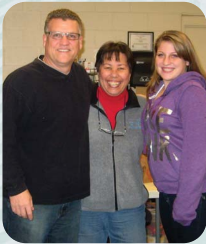
Volunteers for our Christmas Party.

The mild weather and loads of sunshine that we have been blessed with this winter, is a great reminder of the upcoming summer camp that is only THREE short months away. I already have many kids and parents from the school asking me when summer camp starts again, and saying that they want to enroll! We would like to be able to take at least 120 campers again this summer. Unfortunately last summer we