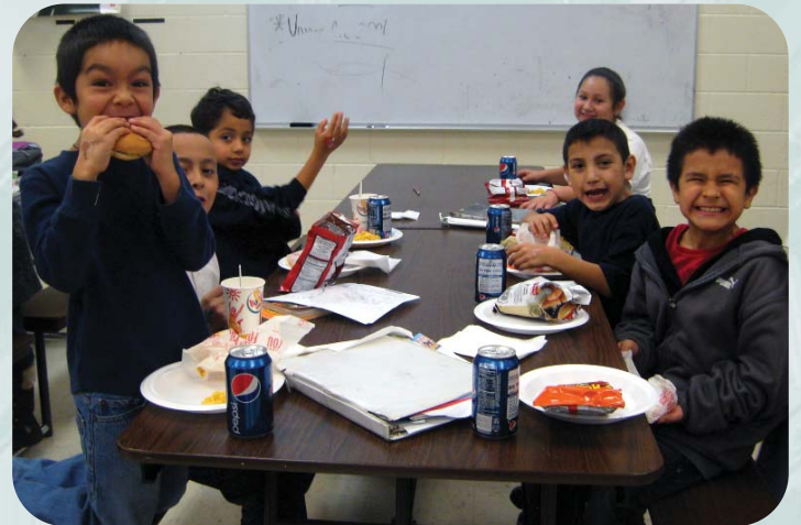
Eating some yummy McDonald's.