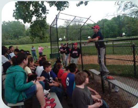
Baseball Lessons with the Aurora Islanders.