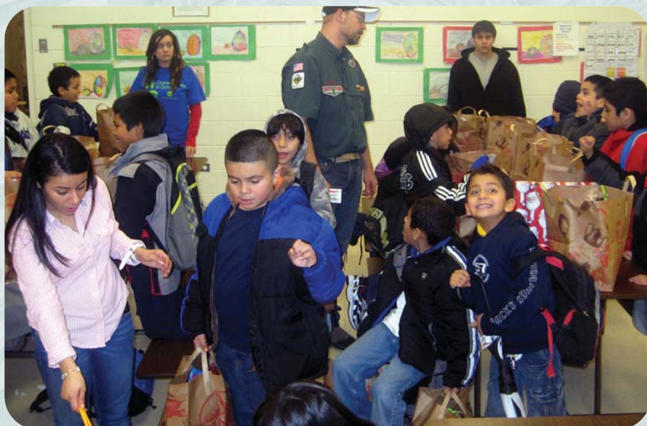
Going home with goodies.