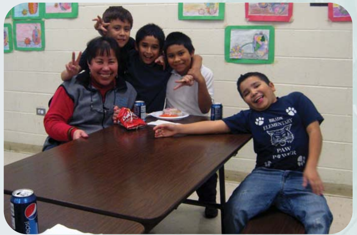
Hanging out with one of the volunteers.

this ministry in bigger ways than I could ever imagine and I cannot wait to "turn the corner" and be amazed at His work in new ways again this upcoming summer!