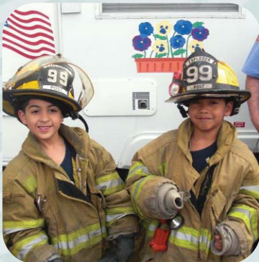
Fun With The Firestoppers.