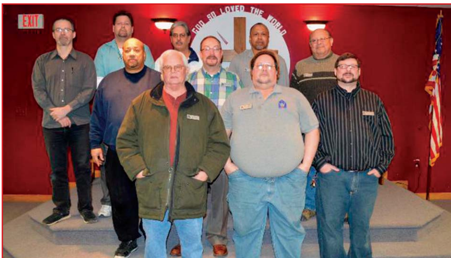
Master's Touch alumni currently on Wayside staff.