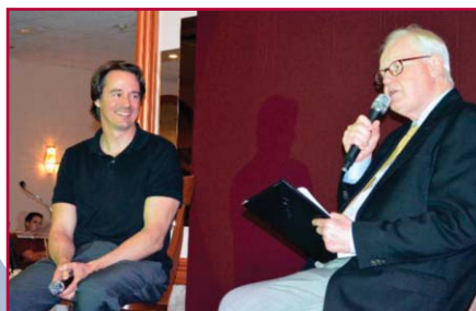
Master's Touch 2013 Banquet